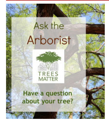
Have questions about those new trees you have planted???