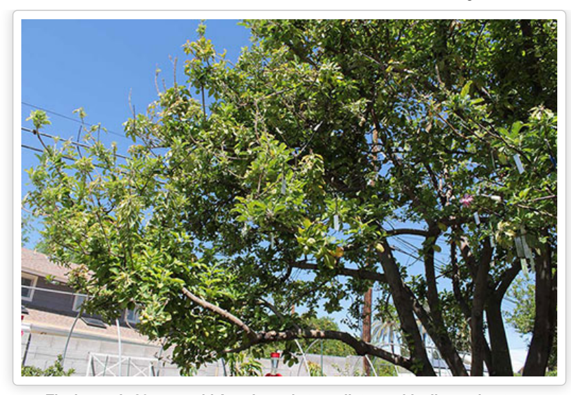
The Layton's 20+ year old Anna's apple tree glistens with silver scion tags.

So go ahead and plan that vacation, just be sure to schedule Yellow Boots Yard Care to tend to your garden while you are away. Jennifer will even send you photos of your plants to reassure you that all is well at your homestead!