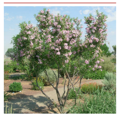
Put in your location and find out!