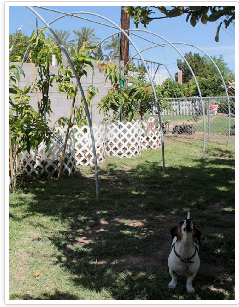
Hoop structure over very happy and healthy mango trees in Layton's garden, provides cold protection in winter, and shade protection in our hot summer months. The Layton's dog Nora warns me to stay away from her mango trees!

The Layton's have 104 fruiting varieties in their yard (10 vines, 32 grafts, 62 main trees). Most of their trees are tropical - 16 mangoes, 4 avocados, and 1 lime tree with 11 grafts on it! These two avid gardeners have experience with plant and tree installation, flood irrigation management, foliar feeding, cold protection of tropicals, shade structure construction, organic pest management, fruit tree pruning, and garden rehabilitation.